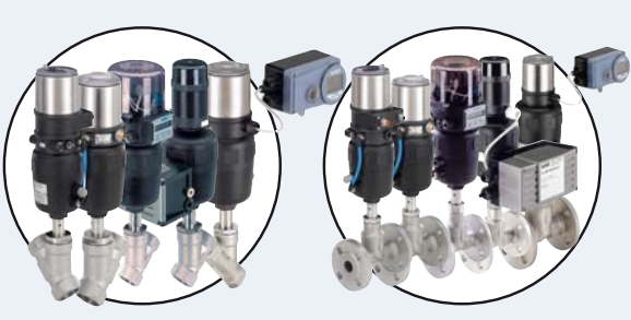
Angle-seat control valve Continuous Classic system Type 8802-YC