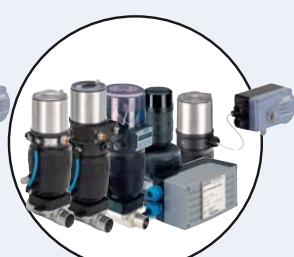
Diaphragm control valve Continuous Classic system Type 8802-DD

The design of the System Type 8802 Continuous Classic enables the easy integration of digital automation modules whether they are simple Positioner Basic, high-capacity Positioner with optional integrated fieldbus interface or even a digital Process Controller with easy handling thanks to the backlighting of the graphics display.